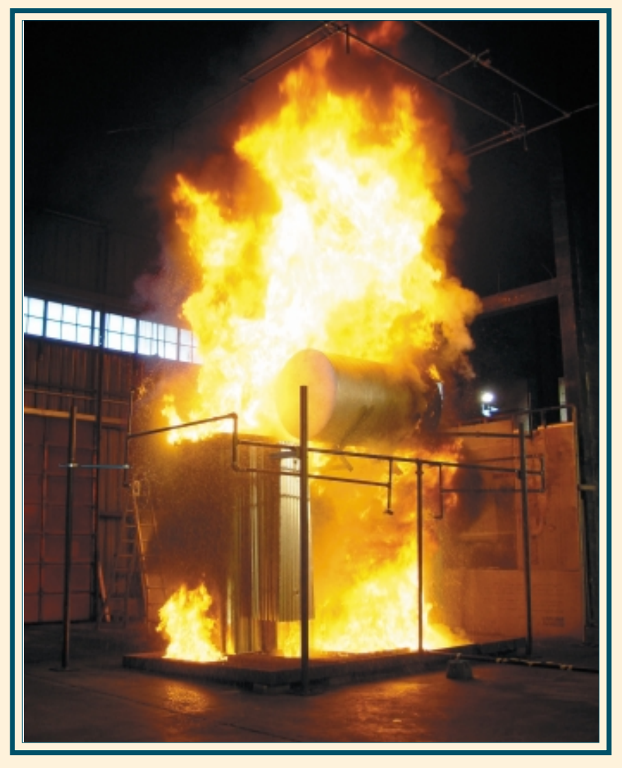
Figure 4. Fully developed transformer fire

CAF Systems have been demonstrated to successfully extinguish challenging fires with less water and less foam than current fire suppression systems using foam and water.