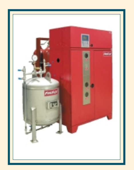
Figure 3. Integrated Compressed Air Foam (ICAF) System Package

comparisons between CAF systems and foam-water sprinkler systems demonstrated the comparative performance of CAF with currentlyaccepted technology. An illustration of this test arrangement during operation is shown in Figure 4.