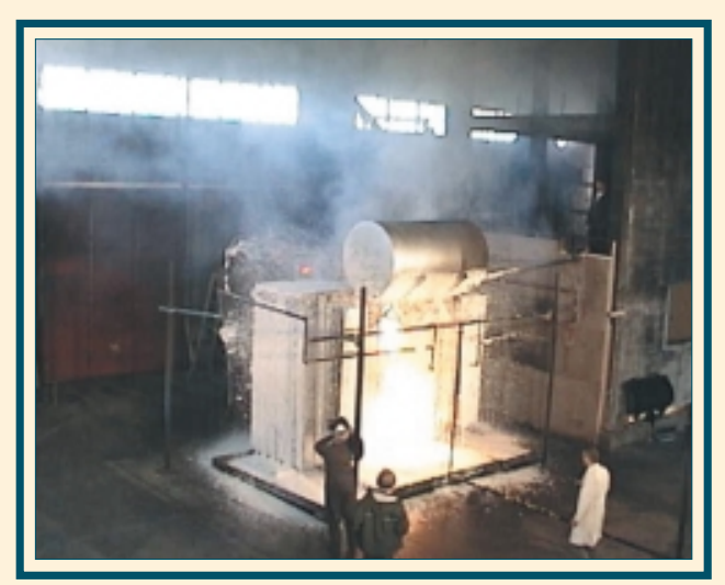
Comparison after 90 sec.