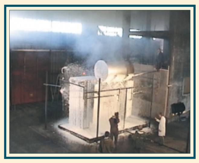
Figure 5. Water Spray system vs. CAF system for power transformer protection

In remote areas or areas with substandard water supplies, CAF systems provide a proven means to suppress flammable liquids fires. In these situations, fire suppressions systems would seldom be installed due to the significant cost or local conditions and hence the hazard would not be protected. CAF systems provide a means to lessen the hazard. As a result of the significantly reduced water and foam usage, CAF Systems can be installed in situations where environmental damage from fire suppressants and the fire itself must be minimized.